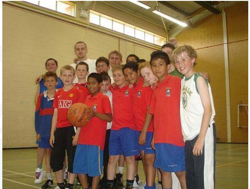
Basketball Coaching Clinic

The Year 7 Boys' basketball team recently competed in the Blackpool schools basketball competition at St. George's High School. They won the tournament, going unbeaten throughout! A big thank